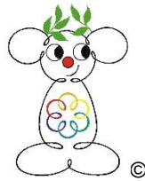
Delphix – Mascot

"The end of culture is the end of education, and the end of education is the end of freedom and justice."