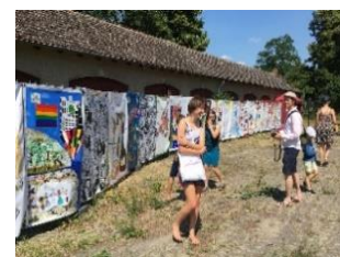
Delphic Art Wall – A wall that unites 2017 / 2018