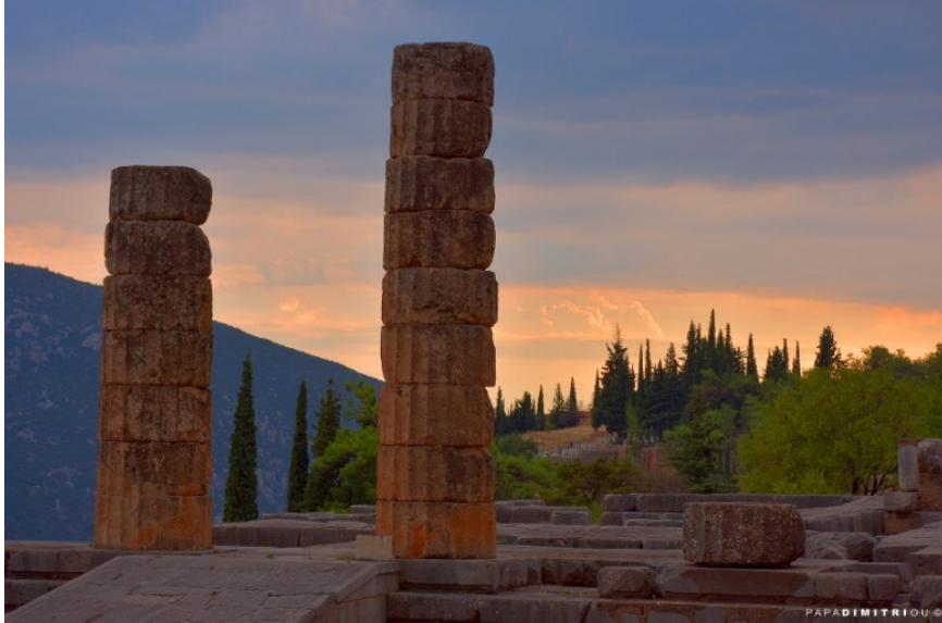
Temple of Apollo in the archaeological site in Delphi, Greece

In ancient times Delphi was considered as the centre of the world. It was here where for almost 1000 years the Delphic (Pythian) Games took place – a peaceful competition of the Arts. After three "holy wars" of the 12 tribes of Greece over the ownership of the sanctuary, they formed an Amphictyony (federation) for joint administration and organization – to keep the peace. The Amphictyony became the forerunner of today's United Nations (UN).