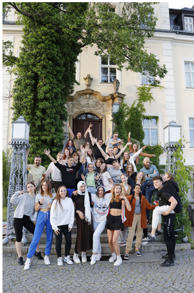
A German Polish student exchange 2021/2022 in Kreisau (Poland). Subject: "Europe. Our history". START-UP FOR PEACE – NO MORE WAR!

Interdisciplinary networking of people of different nationalities creating a digital basis for communication and the events mentioned above.