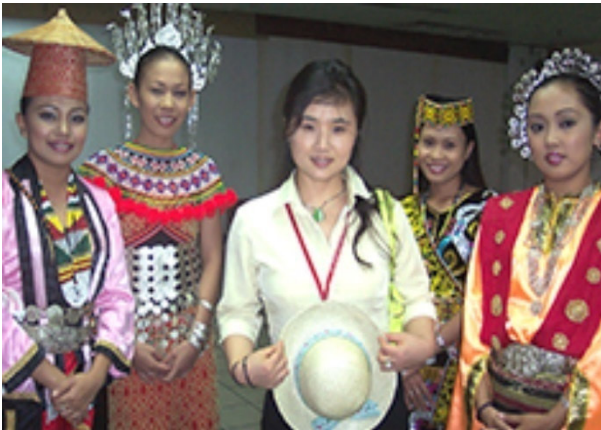
The Games in Malaysia 2005

The Delphic Games are an initiative for education and cultural understanding. They bring together the best artists available at the time of the Games within the six Delphic art categories in peaceful competition.