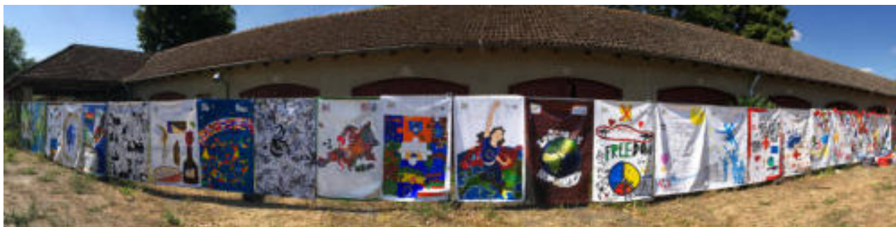
Motto in the European Year of Cultural Heritage 2018

The DELPHIC ART WALL is a multimedia Arts and Cultures project, where students between the ages of 6 and 17 years, in context with the European Year of Cultural Heritage 2018, are called to present and create under the motto “Paint your picture of Europe” their ideas, wishes, and dreams, in public, of a united Europe, in analogue and digital form.