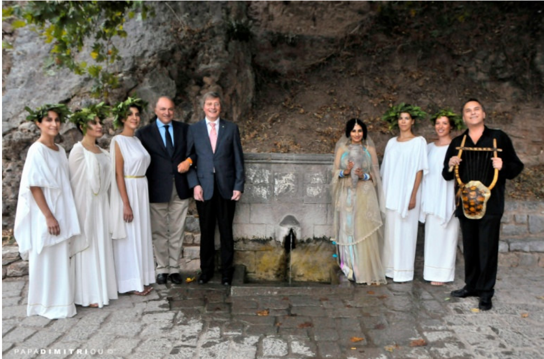
Water Ceremony at the Castalian Spring in Delphi, Greece; September 2015

Delphi is the birthplace of the Delphic Games.