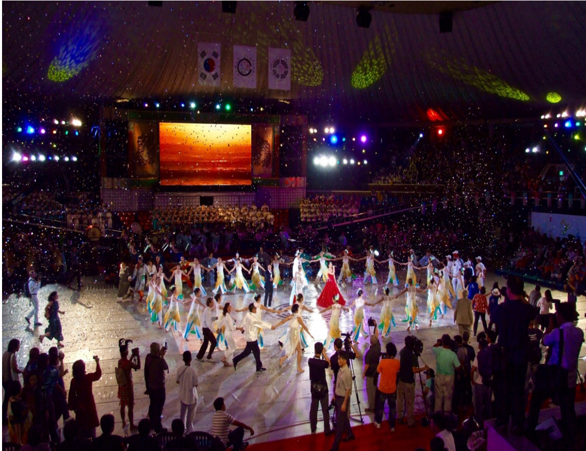
III Delphic Games 2009, Jeju, Korea

INTERNATIONAL DELPHIC COUNCIL 1994 – 2024