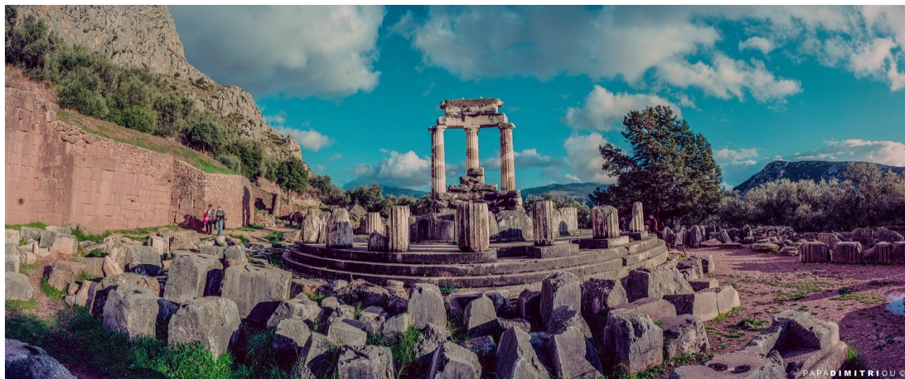
Temple Athena Pronaia in Delphi