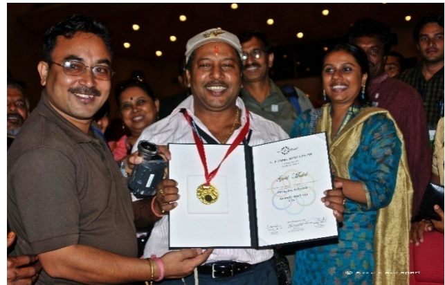
The Games in Korea 2009

Every four year, the Delphic Games strives to live up to its ambitions to unite people of all nations and cultures through a shared enthusiasm and fascination for the arts. The Delphic Games are more than a festival of the arts – they are a kaleidoscope through which we can experience the