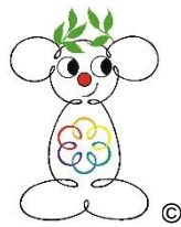
Delphix – Mascot